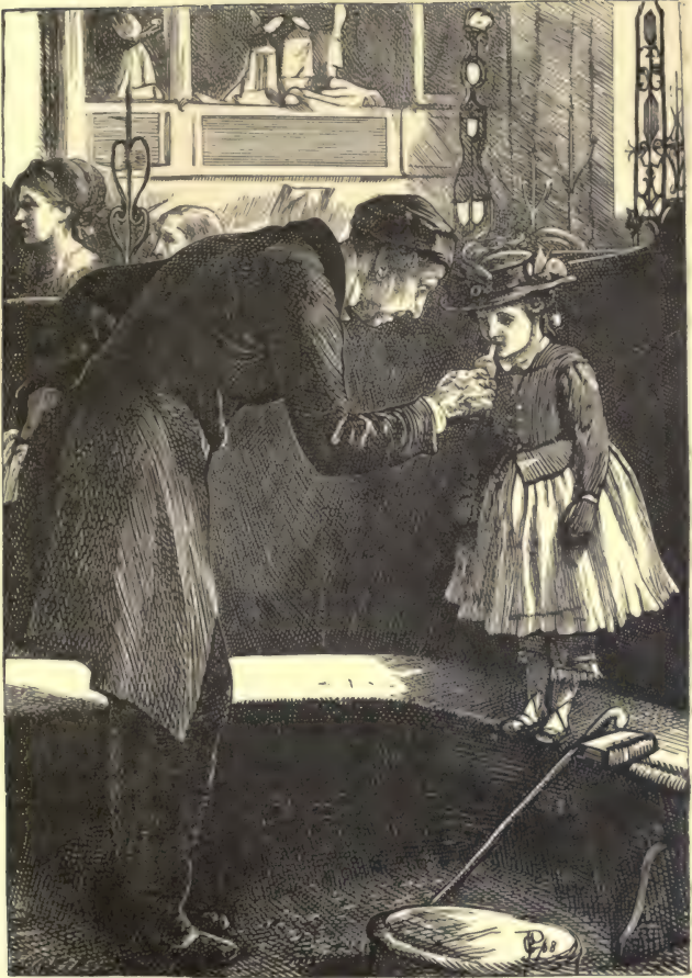
The City Personage.